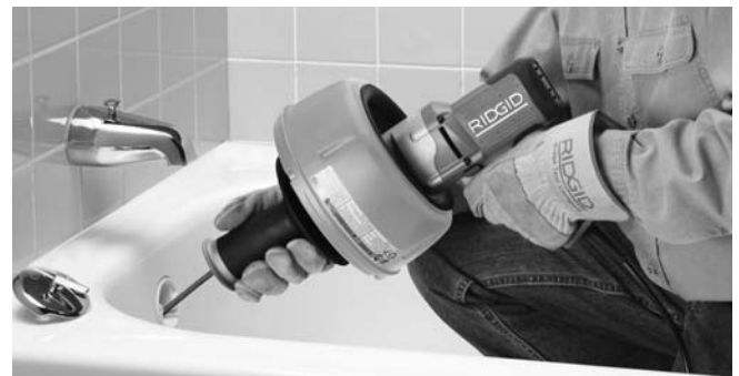
Figure 9 – Push Cable Down Drain Line