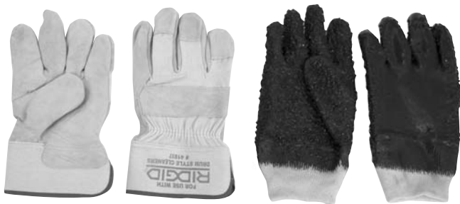
Figure 4 – RIDGID Drain Cleaning Gloves – Leather, PVC