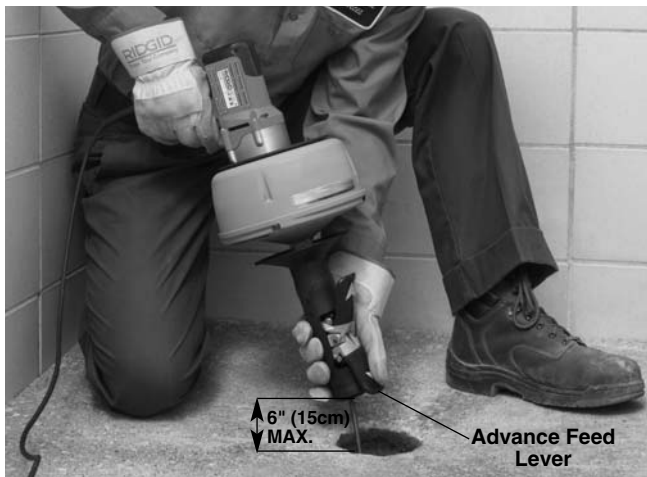
Figure 10 – Feeding Cable With AUTOFEED

Confirm that at least 12" (30cm) of cable is in the drain and that the cable outlet of the drain cleaner is no more than 6" (15cm) from the drain opening. Move the handgrip away from drum to disengage the chuck from the cable. Do not engage the chuck while using the AUTOFEED. Press the ON/OFF switch to start the machine. To advance the cable into the drain, depress the advance feed lever. The rotating cable will work its way into the drain. Do not allow the cable to build up outside the drain, bow or curve. This can allow the cable to twist, kink or break.