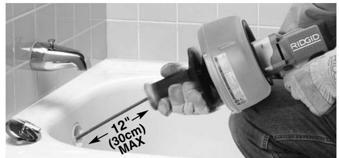
Figure 8 – Move Hand Grip Toward Drum To Grip Cable With Chuck

As feeding the cable becomes more difficult, the chuck can be used to better grip and feed the cable. Move the handgrip towards the drum to grip the cable with the chuck. With the cable rotating (ON/OFF switch ON) move the drain cleaner towards the drain opening to push the cable down the drain. Release the ON/OFF switch. Move the handgrip away from the drum to release the chuck from the cable. Grip the cable with your gloved hand to prevent it from pulling out of the drain and pull the drain cleaner back so that no more than 12" (30cm) of cable is exposed. Repeat the above steps to continue advancing the cable in this manner. (See Figures 8-9.)