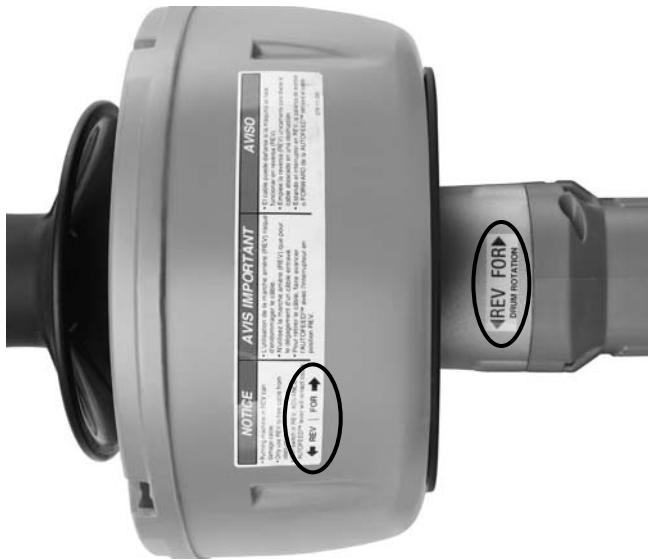
Figure 5 – FOR/REV Labels