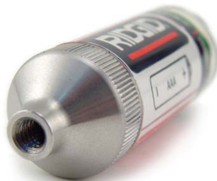
Figure 2 – to install the transmitter onto a push cable, screw the threaded end of the battery cover onto the end of the push cable. Tighten with pliers to make sure it doesn't work loose during use.

Figure 1 – When the transmitter is ON, the red LED will flash slowly. When there is not enough power for proper operation, the red LED will flash rapidly. If LED does not flash, or if it flashes rapidly, replace the AAA battery.